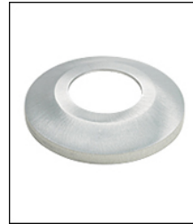
COL1-A12C FC-11 Cast Alum 1-Piece