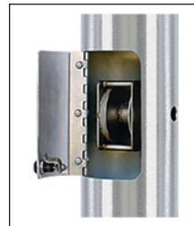
XIWW - WINCH Reinforced Welded Door Frame