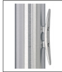
CLA-9090-SAT | 8' from bottom Cleat Only