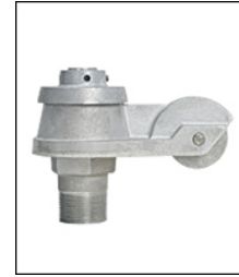
TRK-9420-58 HD Truck - Single Rev. Sealed Bearings