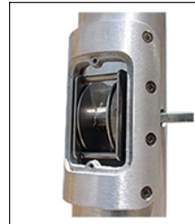
ISW - WINCH