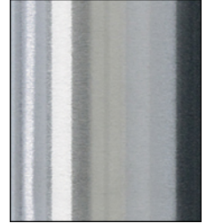
SAT Satin Finish