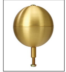
BAL-1058-GLD HD Gold Anodized Aluminum Ball