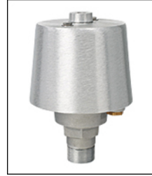
TRK-9800-58 Int. Revolving Truck Sealed Bearings