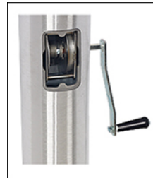
IRW - WINCH Reinforced Welded Door Frame