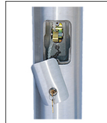
IRC - CAM CLEAT