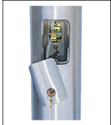
IRC - CAM CLEAT Reinforced Welded Door Frame